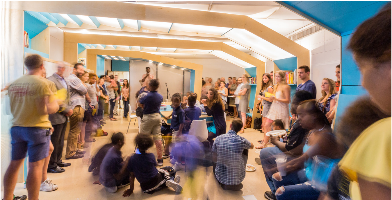
Figure 1: Big Class Writers' Room Event. Spring 2017 design/build collaboration with a non-profit youth writing program