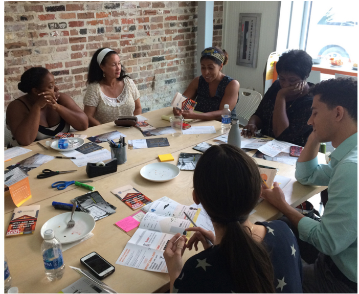
Figure 2: RFP Jury Process, Scorecard (left)

increasing equity), WANT for the project (does it provide and exciting design and education opportunity for our students?), and ABILITY to create a successful project (both in our ability to execute a project, and our partner's ability to maintain the built project or advance a visioning project). In addition to grounding our yearly project slate in actual needs of our partners and in our abilities, this RFP process is a first step in building trust with our stakeholders.