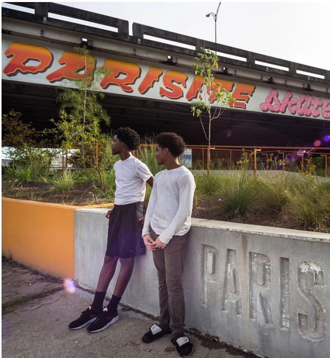
Figure 4: Parasite Skatepark: a collaboration which established a working relationship with city agencies, state agencies, and site partners. The initial capacity building within an organization of skaters, Transitional Spaces, happened through a design/build project process and led to subsequent site development spearheaded by the Transitional Spaces team.

for our students to adjust to after 3-4 years of being the sole author of studio based design solutions. This uncomfortable struggle of collaboration involves suppressing ego while expanding listening and communication skills. One of the most challenging aspects of a single outcome oriented studio is working from many design ideas to one solution. The structure of a team based studio is a key part of our pedagogy yet runs counter to the traditional architecture studio experience. The other reality that students come to terms with in working on a community-based project is the limit of design. Often the solution to a problem our partner has cannot be solved by design, or at best design is part of a multi-disciplinary solution. Several of our project teams have included business and law students, strategic planning consultants, farmers, engineers, web designers, artists, and an array of other consultants who together build capacity and position a project for success.